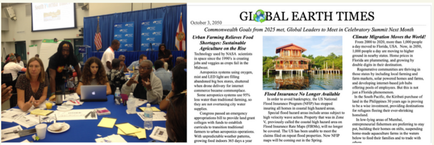
Tabletop Simulation: Solve simulated real- life challenges with friends and neighbors. Share your solutions with a response panel of decision-makers.

Made possible with generous support from Ammonoosuc Community Health Services.