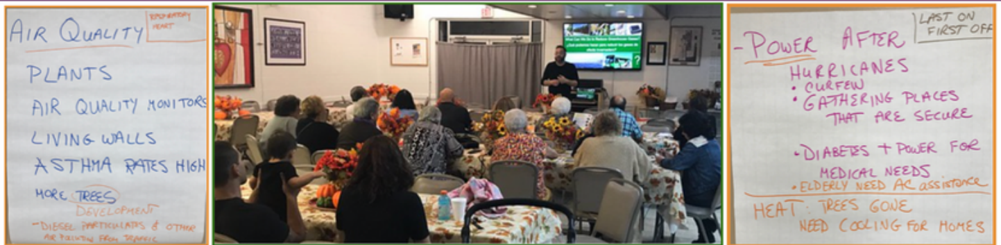
Community Forums: Map community assets, services and liabilities. Identify solutions.

To connect people with shared interests and concerns. To communicate with funders and others with resources to address our needs.