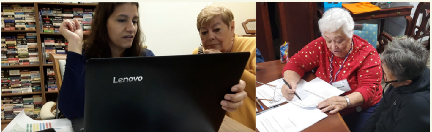
Survey: What do you think is needed?